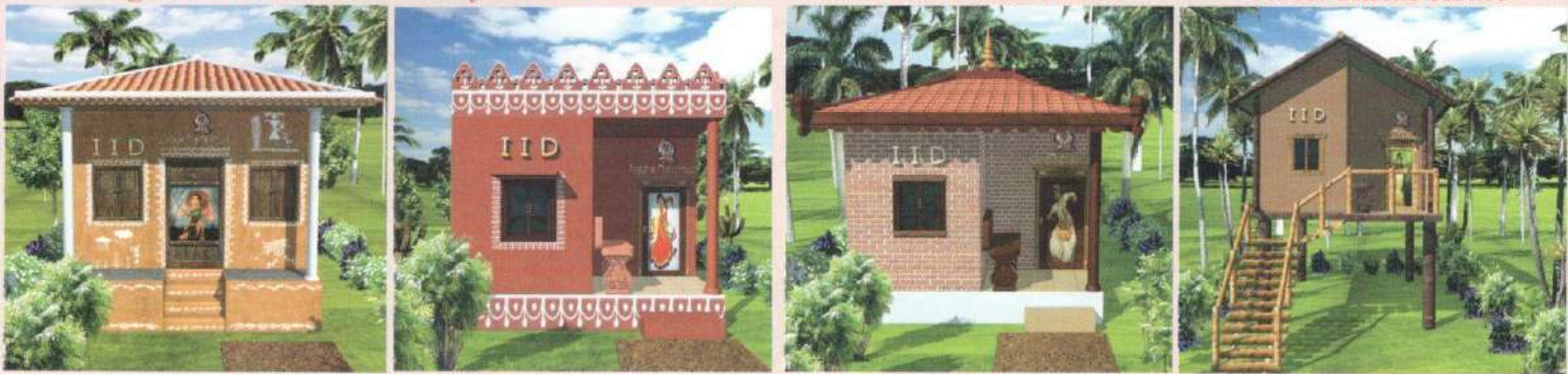
Forest Theme House

Our Subscribers will get Membership Card for 1+4 members which will enable Free entry for life time and Pay Half Card worth Rs. 250/- per sq.yd. on purchased plot size which will enable our Subscribers to get 50% Discount on all games in NATURE CAMP GAMING & PICNIC PARK belongs to INDO-GRAND RESORTS till 10 years or till complete usage of Pay Half Card with in 10 years Subject to Nature Camp rules & conditions