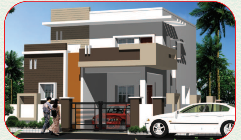
LUXURY DUPLEX VILLA